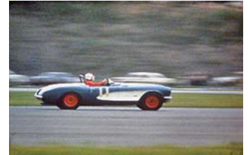
Dr Dick Thompson

The Cumberland National SCCA race was held at the local airport, using most of the runways and some taxi areas for the course layout, which was marked with cones and hay-bales. The paddock was within the course and we set up our little piece of ground alongside one of the back straights, and who should arrive to claim the adjacent area? The Rose Team, with the two black Sebring cars, the red SR2, and the ready- to- race and also win aluminum finish Maserati!