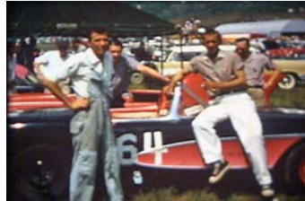
Carroll Shelby (Standing) Ebb Rose (sitting)