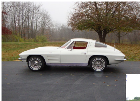
coupe. Greg Gorniak is in the process of completing a full body off restoration on Tony's 54' More about these later.

Mike Glaunsinger and Karl Clauss recently completed a full body off restoration on Tony's split window 63'