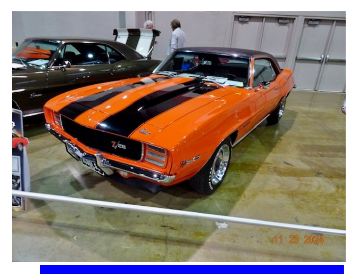
We're on the web! www.ncrs.org/hoo