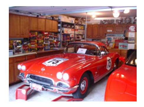
Continued on Page 6