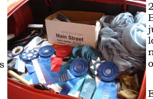
Volume 5 Issue 2